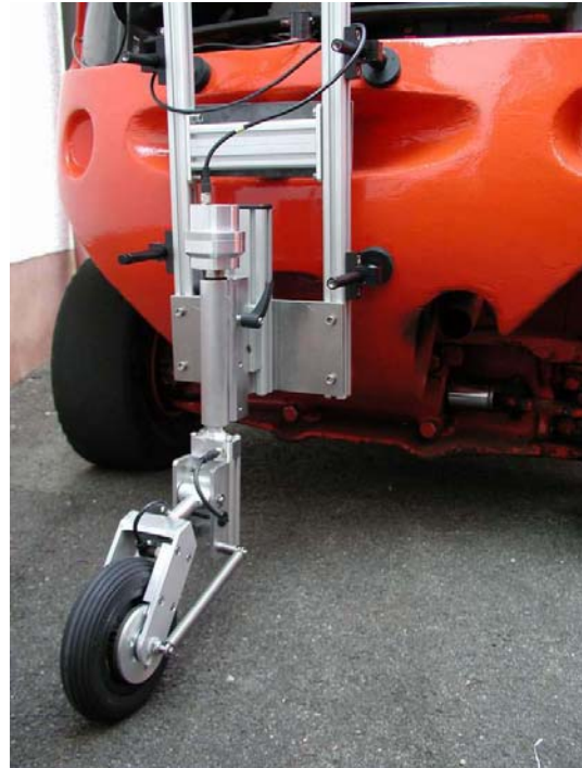
5W-6 Miniwheel with H-adapter and magnetic holders at the rear of a forklift truck